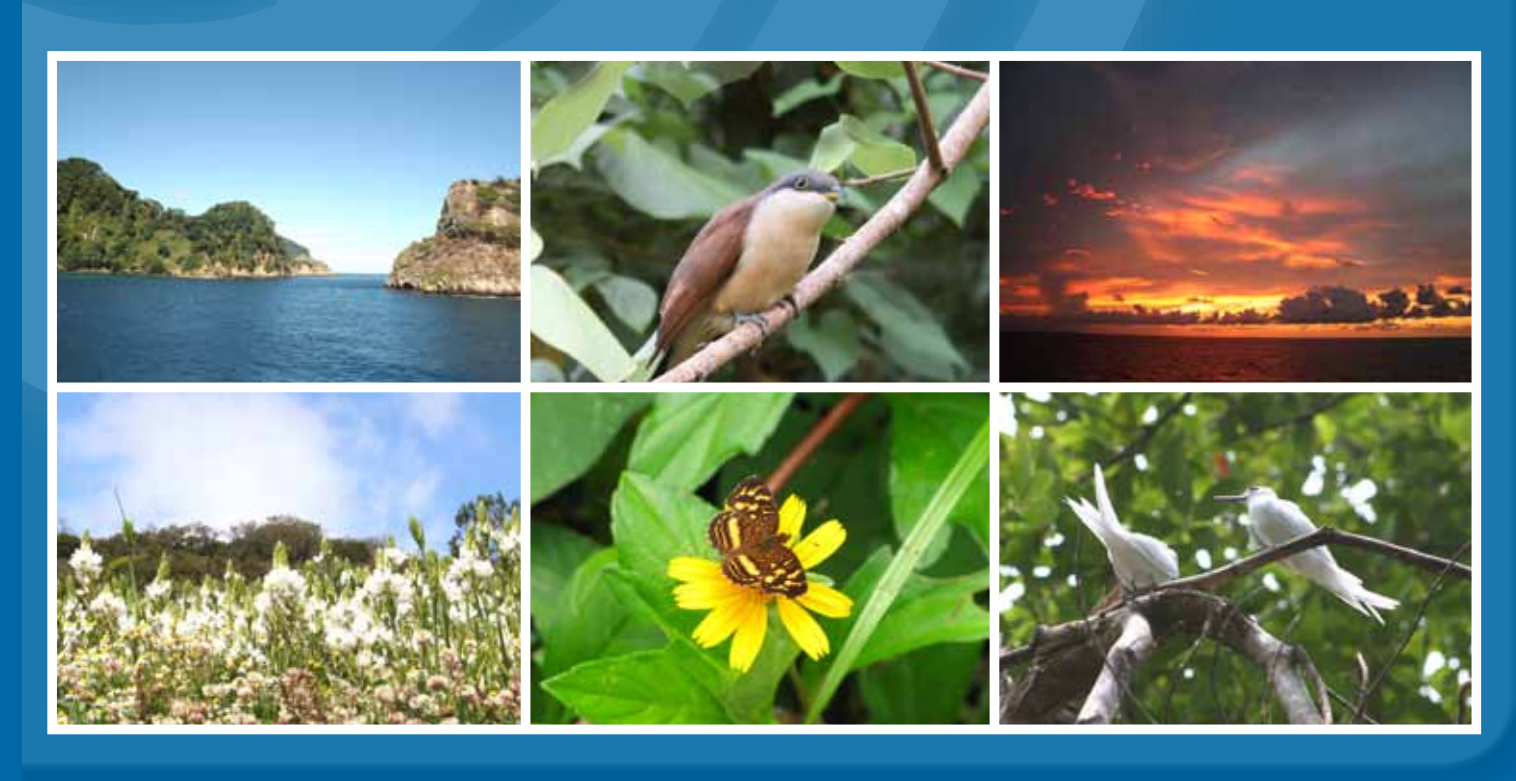
Earth Charter International Secretariat