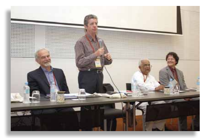
EC panel during PWR, Australia

Another priority for this task force is to further raise awareness about the EC within the religious community by sharing the Earth Charter at international events (conferences, workshops and others). The following are examples of important events where the EC was featured and shared.