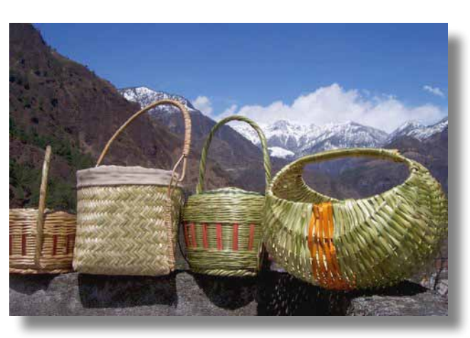
AAGAAS campaign in Himalayas, India

Earth Charter Indonesia is a network of affiliates and supporters, who meet periodically and share efforts about how to use and promote the Earth Charter in Indonesia. Find more information about decisions and actions taken here.