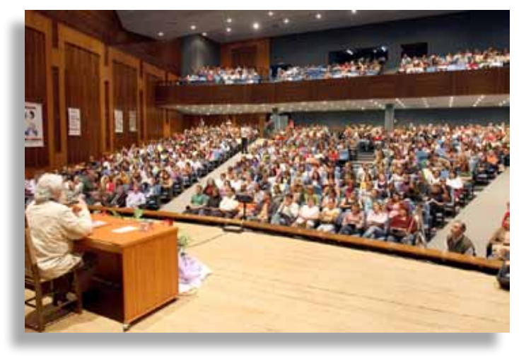
Workshop organized by Itaipu, Brazil

In Brazil , the World Social Forum took place from 27 Jan − 1 Feb (in Belem, State of Para), and several Earth Charter supporters (affiliates and advisors) participated and organized two side events.