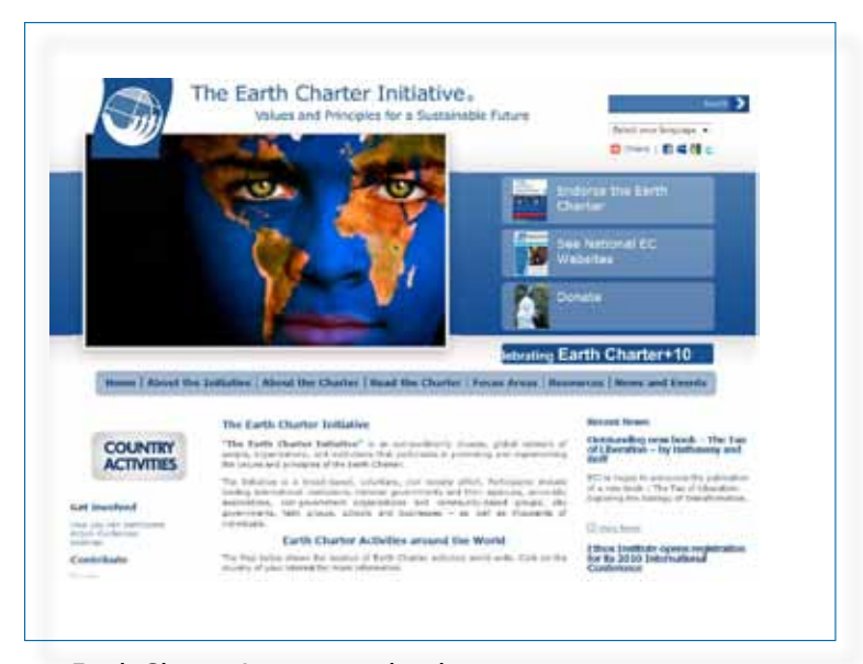
Earth Charter International webpage

ECI Secretariat has made a special effort to consolidate its international website in English, Spanish, and French, which features 91 country pages offering an overview of activities and organizations involved with the Earth Charter Initiative in each country, and a Virtual Library with over 800 resources. In 2009 there were over 480,000 visits to the main Earth Charter website and 164,000 visits in the Earth Charter page at Wikipedia in English and Spanish.