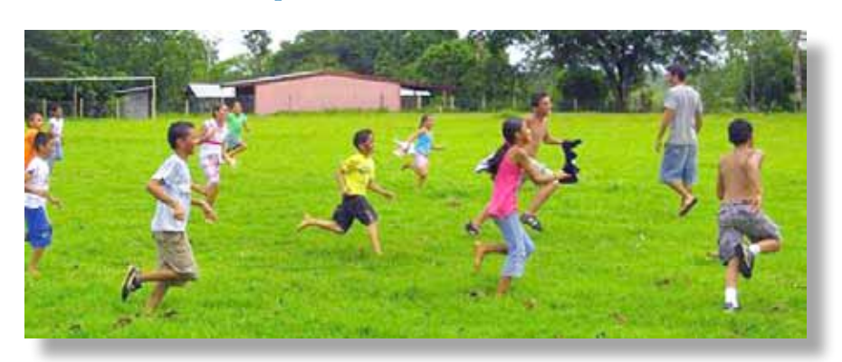
EC workshop organized by Reto Juvenil, Costa Rica

for Sustainability), which is based on the Earth Charter, was reviewed and republished in 2009. This book was first published in 2006.