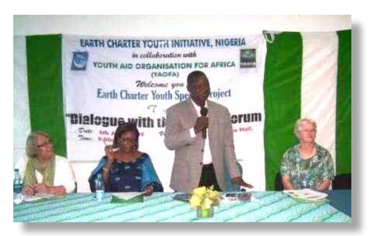
Activity under Special Projects Fund, Nigeria