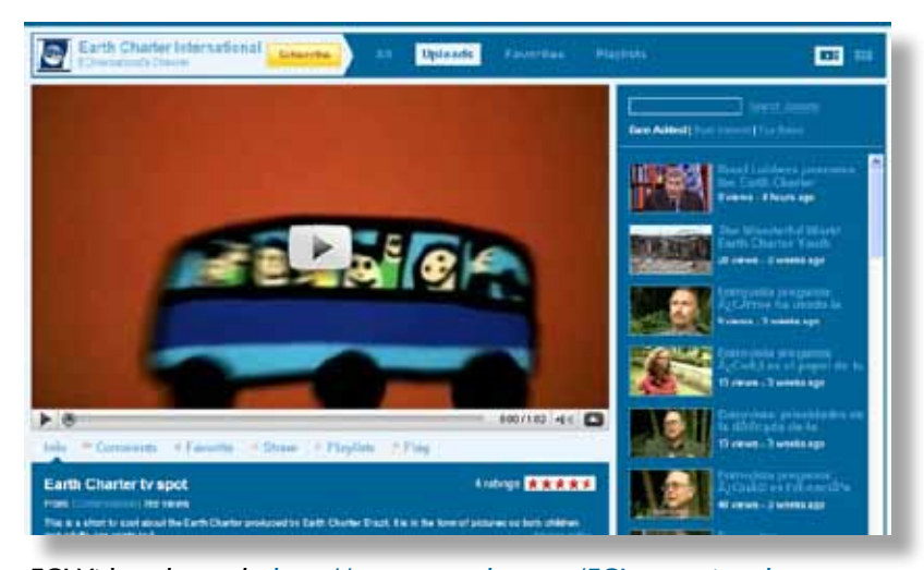
ECI Video channel: http://www.youtube.com/ECInternational

In May, ECI Secretariat launched its first Earth Charter video channel on YouTube, with the purpose of sharing EC videos, stories, and interviews with the hope that such tools will inspire many groups and be widely used by anyone interested. The EC YouTube channel currently has 66 videos uploaded in different languages, which have been watched by nearly 20,000 viewers since its launch.