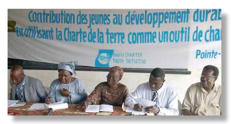
Activities under Special Projects Fund, Congo

Togo – Project: Promotion of Youth Leadership for Sustainable Development in Central Togo Based on Values and Principles of the Earth Charter. By: Togolese Foundation for Peace.